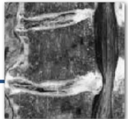
Disc Begins to Die

Because the root cause is usually not addressed, the problem continues and causes the disc to die.