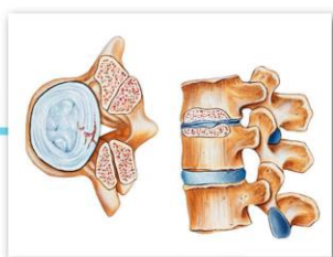
Damaged Spinal Disc

•The underlying problem causes the disc loses circulation, its source for staying healthy.